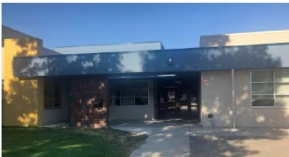
Zone 1 Door/Office Entrance