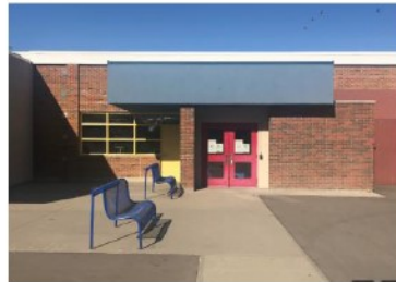
Zone 3 Door/Entrance (By gym and outdoor basketball courts)